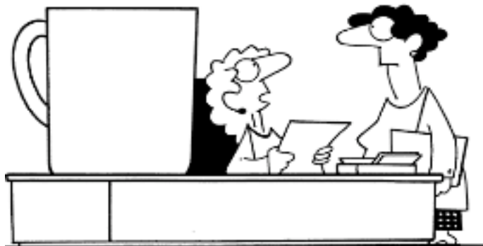
"Don't be alarmed. After 4 cups, I switch to decaf."