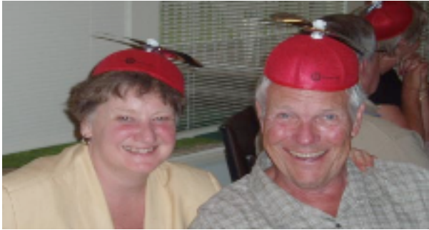
Oh, what a year it's going to be!